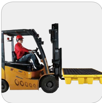
2-drum and 4-drum spill pallets have forklift slots for convenient forklift operation to improve efficiency (*forklift overload prohibited)