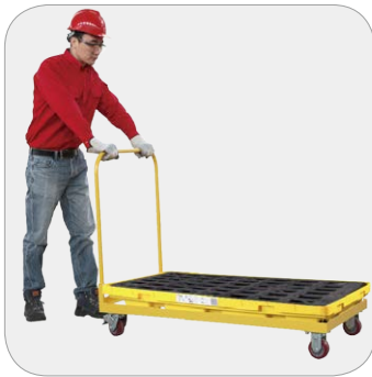
2-drum spill pallets with stackable structure save space and transportation costs