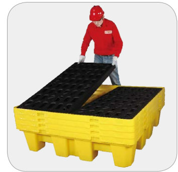
2-drum and 4-drum spill pallets with stackable structure save space and transportation costs