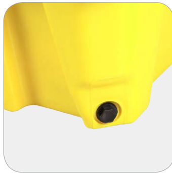
Hexagonal drain plug facilitates drainage