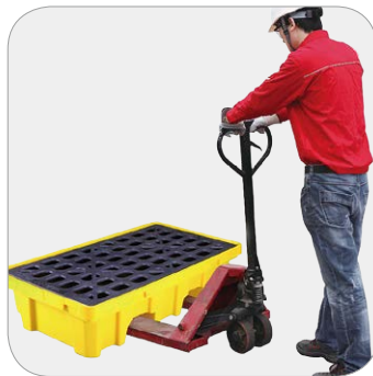
Hydraulic carrying vehicles can also be used to move pallets, which is more convenient