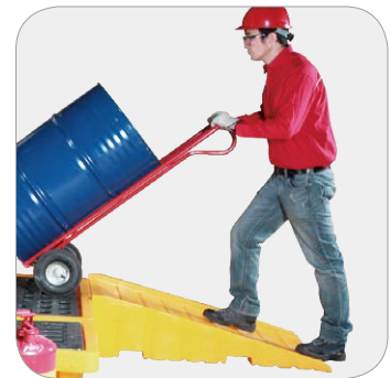
Poly spill pallet ramps make it easier to move large articles